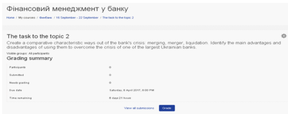
Fig. 7. The fragment of the module «Task» of the discipline «Financial management in a bank»