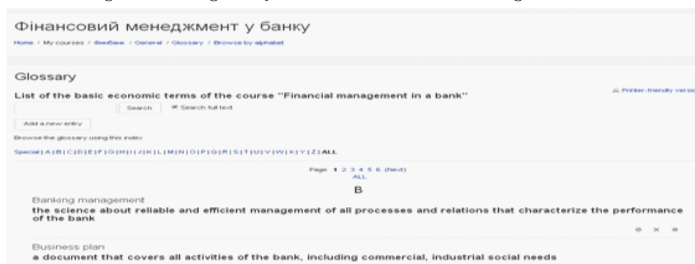
Fig. 2. The fragment of the glossary of the discipline «Financial management in a bank»

The glossary in the Moodle system is an electronic analog of a directory of terms. Its difference from the traditional dictionary is that the glossary can be sequentially created and supplemented by trainees throughout the training period. The glossary is a convenient way to introduce definitions that will be associated with the whole course's content. The fragment of the glossary of the course «Financial management in a bank» is shown in fig. 2.