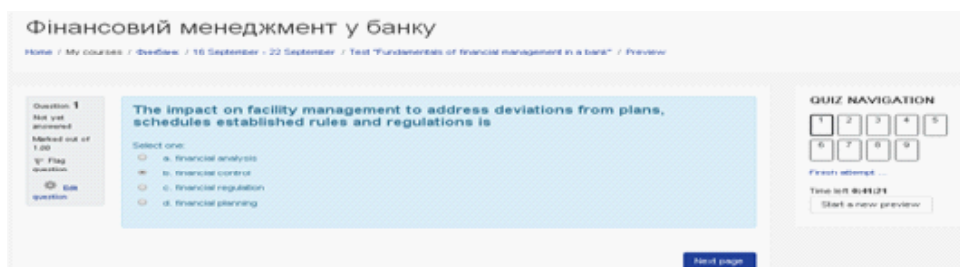
Fig. 3. The fragment of the test of the discipline «Financial management in a bank»

The fragment of the test of the discipline «Financial management in a bank» is shown in fig. 3.