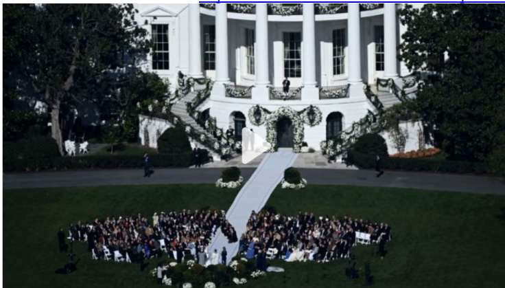
Naomi Biden gets married at White House

https://edition.cnn.com/2022/11/18/politics/white-house-wedding-naomi-biden/index.html