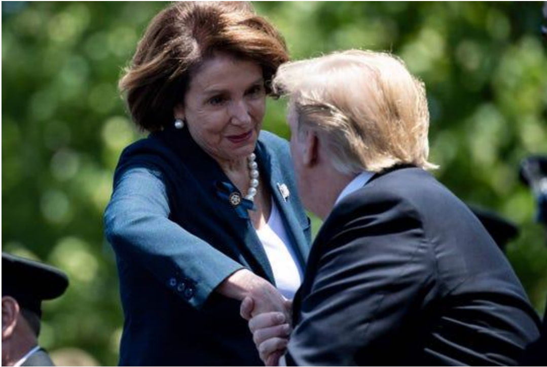
President Donald Trump shakes hands with House Speaker Nancy Pelosi as they attend the 38th Annual National Peace Officers Memorial Service on May 15, 2019, in Washington, DC.

They have long been polarizing figures. In a USA TODAY/Suffolk University Poll taken last week, both had unfavorable ratings higher than their favorable ones. His favorable rating was underwater by 18 percentage points; hers by 14. His job-approval rating was a bit better than hers, at 48% approve-50% disapprove. Her job-approval rating was 42% approve-50% disapprove.