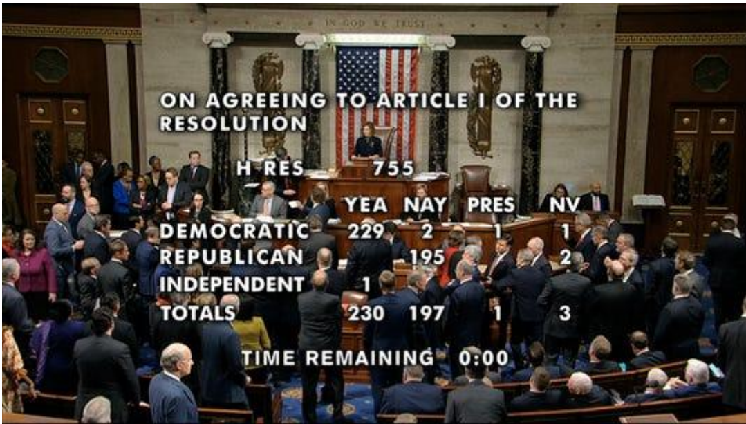
House Speaker Nancy Pelosi of Calif., announces the passage of the first article of impeachment, abuse of power, against President Donald Trump by the House of Representatives at the Capitol in Washington, Wednesday, Dec. 18, 2019.