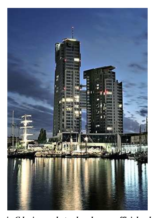
Fig. 2. Sea Towers in Gdynia – a photo placed on an official website of Sea Towers

Finally, when the construction was completed in 2009 it turned out that the observation platform and cafes are reserved only for the residents of the building and there is no such thing like a social space that is generally open and accessible to people. In fact, what they created is an empty, grey and concrete square (fig. 3). It is not used neither by the residents of the towers nor by any other citizens of Gdynia or tourists. What is more, the