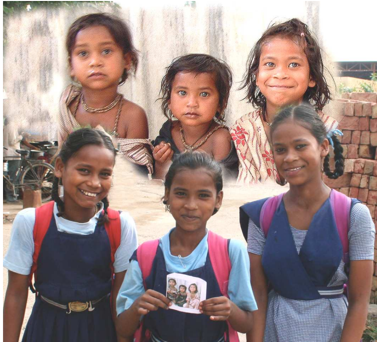
Fig. 5. Save Our Girls program