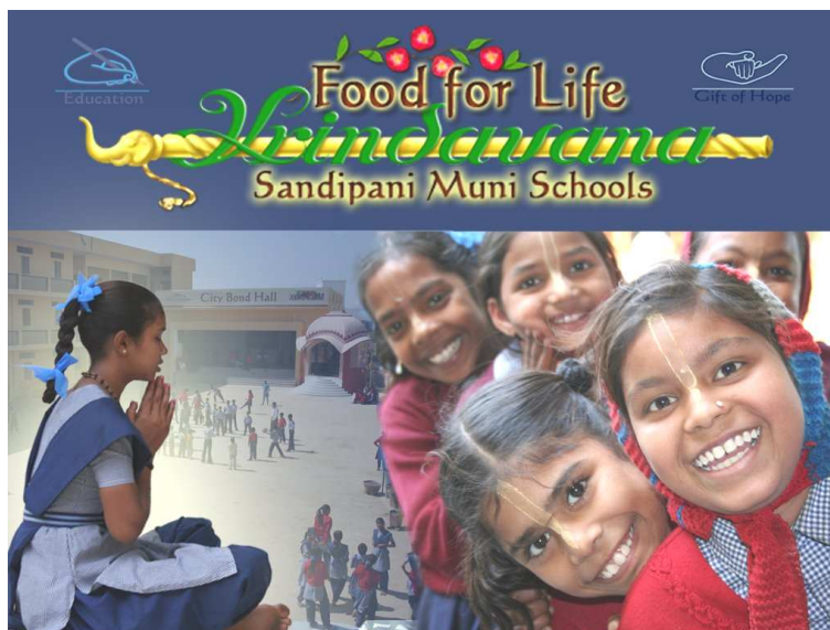
Fig. 4. Sandipani Muni Schools for girls

eral are considered a burden and many Indian families regard them as heavy liabilities [46] is certainly one. The practice of aborting female fetuses is widespread, and the United Nations Children's Fund estimated "...that up to 50 million girls and women are „missing“ from India's population because of termination of the female foetus or high mortality of the girl children due to lack of proper care" [47].