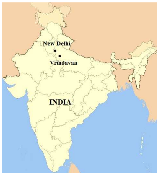
Fig. 3. Vrindavan's location in India

4. Food For Life Vrindavan. The city and the rural area around Vrindavan, which is known amongst the religious people as the land of Radha Rani , have more than 5.000 temples. Some of them are said to be 5.500 years old [37]. In the line of Vaisnava faith the temples serve as gathering places for the devotees to remember the pastimes of Radha and Krishna [38]. Vrindavan is a small town on Indian scale, which qualified as Nagar Palika Parishad [39] in the district of Mathura, in the state of Uttar Pradesh, North India, figure 3 . Census India 2011 provides the following data about Vrindavan, table 2 .