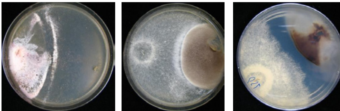
Figure 2. The selection of endophytic antagonists to Dothistroma pini based on the formation of inhibition halo

Thus, if the effect of specific endophyte is real, then the means would also record the same behaviour, and the subtraction of the means of controls from the pathogen replicates involved in the test would then be a negative number (Rigerte et al., 2019).