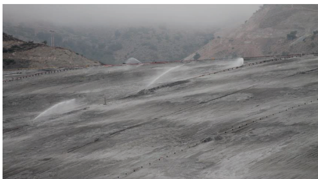
Fig. 3. The technology of moistening the dusty surfaces of the Mauro tailings dam at the Los Pelambres copper-molybdenum mine in Chile (photo) [19]

Fixers are applied to the surface of the tailings dams. In bulk-type tailing dams, light fractions (silt and clay) are concentrated in the upper layer of beaches. Up to 90 % of the particles of these fractions are in the upper (10–20 mm) layer. The filtration coefficient of the upper layer is on average 0.02–0.03 m/day. Due to the low filtration, the penetration of fixing solutions deep into the tails does not occur and an insoluble crust does not form. After drying, a thin film forms on the surface of the fixer, which is easily destroyed and washed off with water. Most of the fixing mortar escapes along cracks or collects in formed depressions. Anti-erosion film is a sliding plane with reduced strength characteristics – the angle of internal friction and adhesion, which contributes to the destruction of dams. Tails with various fillers and additives undergo natural leaching, which products violate the ecosystem of the environment [20, 21].