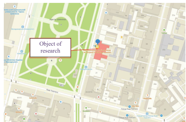
Fig. 2. Placing the object of research on a fragment of a Kyiv map (Ukraine)

Fig. 2 shows the placement of one of the objects of research on the example of the building of the Khanenko National Museum of Art (Kyiv, Ukraine).