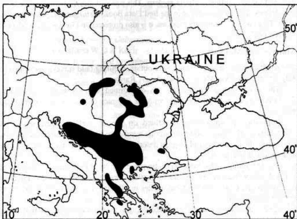
Fig. 1. Distribution of Sempervivum marmoreum Griseb.: — locality on Kobyla Mt. In the Ukrainian Carpathians

Sempervivum marmoreum (= S. schlehanii Schott = S. assimile Schott = S. tectorum L. subsp. marmoreum Maire & Petitmengin) is a species with a Carpathian-Balkan range (Fig. 1). It occurs in Slovakia, Hungary, Romania, Ukraine, Bulgaria, Macedonia, Serbia, Montenegro, Bosnia and Herzegovina, Croatia, Albania, and Greece [1, 2, 10, 14, 15, 17, 18, 20–23]. In the Carpathians its localities occur in all three main parts of these mountains — the Western, Eastern and Southern Carpathians, though the West-Carpathian segment of the range is separated by a considerable hiatus. In that region, i.e. at the northern edge the its range, which reaches the latitude of 48°40' N in Slovakia [23], the species is confined mostly to low elevations, ca. 250–500 m above sea level (a.s.l.). However, in more southward localities, e.g. in Bulgaria, it also inhabits sites in the high-mountain zone up to 2700 m a.s.l. [1]. The main part of the species range lies in the mountains of the Balkan Peninsula [10].