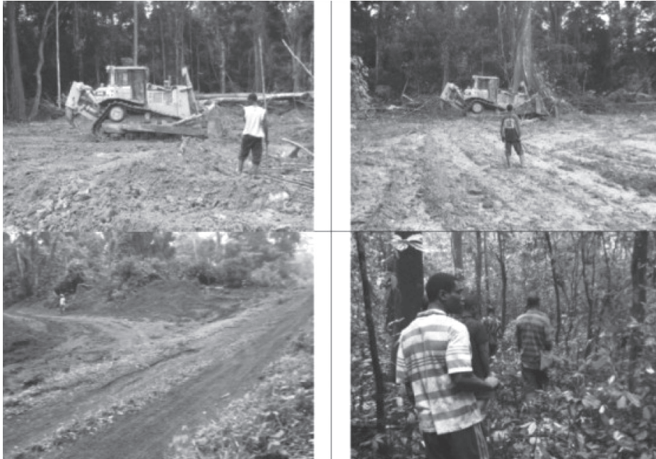
Fig. 3. After the destruction of the forest. Photo by Joshua Linder[13]