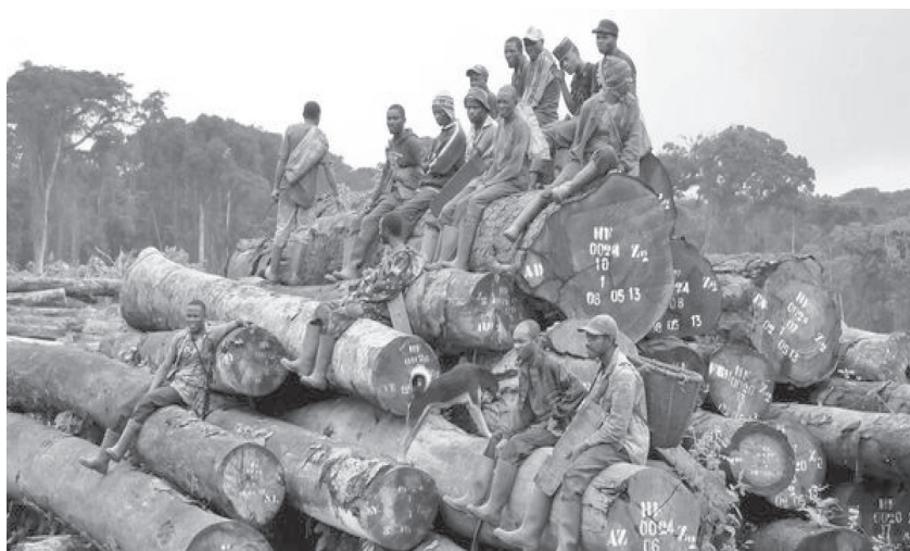
Fig. 6. Logged wood in the Herakles Project site [13]

“A large majority of local people are opposed to what Herakles is doing, and we wanted the world to see that reality” stresses Nasako a profound activist of the project.