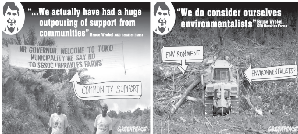
Fig. 7. Opposition from Local Communities in the project site

In January, 2017, the people of Nguti Sub division blocked all roads leading to the forest where timber is being exploited and taken to Nguti town for processing and identification. The protesters have also revealed the dubious nature of the timber.