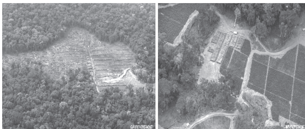
Fig. 5. Herakles Farm transformed forest to oil palm cultivation [13]

Aware of the fact that this eco-region is considered a biodiversity hotspot which by induction is home to many endangered species including chimpanzees and forest elephants, it is obvious that these animals are bound to loss their habitats and become stray (Fig. 5). The eco-region equally provides a handful of services like hunting and fishing grounds, medicine for local communities to mention a few. All these environmental potentials are been threatened by the proposed palm oil plantation that would flatten an area eight times the size of Manhattan.