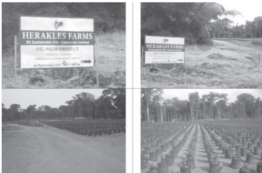
Fig. 4. Oil palm nursery near Korup National Park.