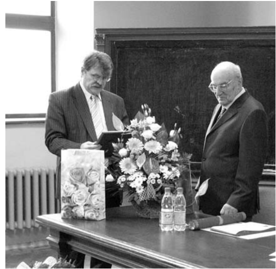
Fig. 8. Congratulations at the 80 th anniversary, 2008