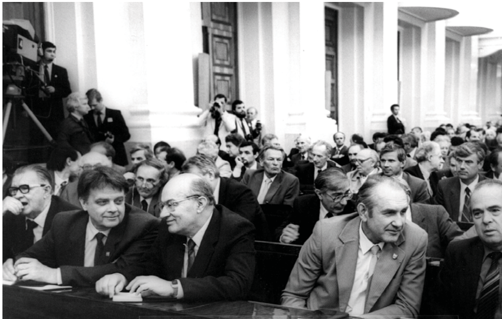
Fig. 6. Andriy Rudnytskyi (in the first row, in the middle) at the All-Union Architectural Congress. Moscow, 1987

made to organize a new large urban park in the southern part of the Vynnyky forest. Pedestrian and bicycle accessibility, the proximity of natural and historical tourist spots, location on the Main European Watershed, which has a great potential for attracting tourists, were the arguments in its favour.