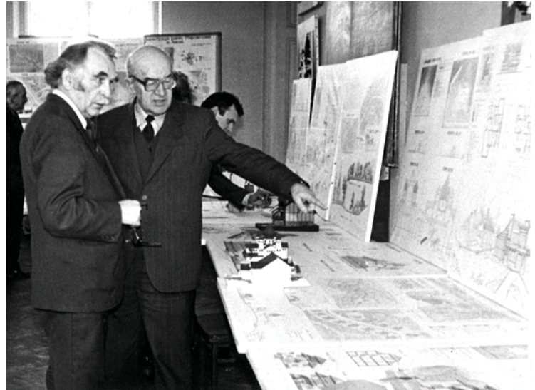
Fig. 2. Viewing student's works, 1980s; photo from the authors' archive

The factual material of the biography of Andriy Rudnytskyi does not represent a complete list of the main stages of his development, just the most significant professional and scientific achievements. The name of this person is associated with the Lviv architectural school, which not only survived in the conditions of the totalitarian Soviet “equalization” but also managed to preserve its unique tradition. The architectural school of Lviv was the subject of scientific research in numerous studies. In the circles of architectural education of the 1960s–80s, it deserved the same respect as the architectural schools of the Baltic republics, Moscow, Leningrad, Kazan, and Tbilisi, which in the architectural field of the former USSR were considered to be generators of new and creative ideas. For example, in the article on results of the contest for the best diploma projects in the field of architecture, held in 1978 in the city of Tallinn, with the participation of 247 projects from 44 architectural institutions of the USSR, we find: