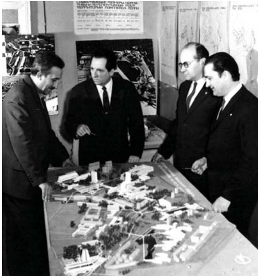
Fig. 7. At the project discussion in SDB LPI, 1970s