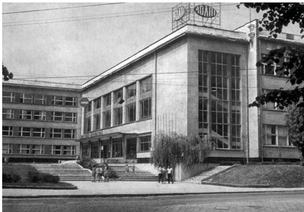
Fig. 4. Lviv Polytechnic teaching building No.1 (Postcard from the authors' archive, 1971)

of the entire ensemble. Continuing this tradition, Andriy Rudnytskyi very successfully fitted his building into the historical ensemble of the street. In front of the new building, he designed a landscaped square, and the architecture of the building itself combines functionality with a concise but gracefully proportional architectural solution. It was not easy to do during an aggressive “struggle with excesses” in architecture: the construction of the teaching building No. 1 was completed in 1966. Professor Rudnytskyi was awarded the state prize for the developed project.