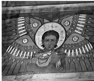
Fig. 8. Polychrome paintings by M. Sosenko (1913–1914), photo by A. Tyrpych, 1991