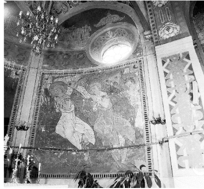
Fig. 5. Polychrome paintings by M. Sosenko (1911–1913), photo by V. Radomska, 1991