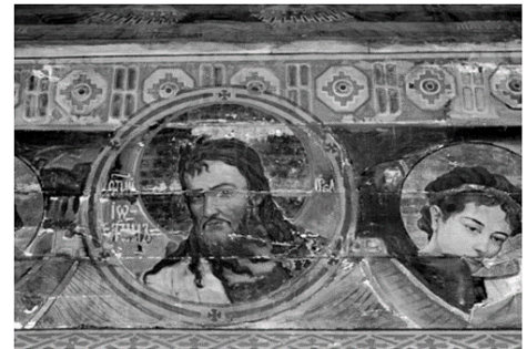
Fig. 9. Polychrome paintings by M. Sosenko (1913–1914), photo by A. Tyrpych, 2015