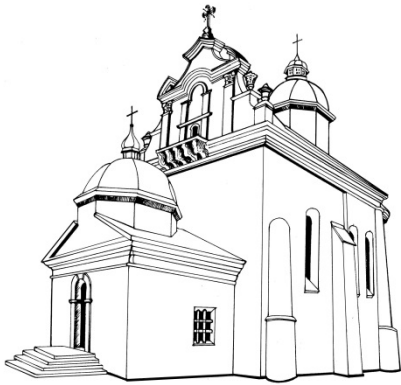
Fig. 4. St. Nicholas Church, Zolochiv, graphics by A. Tyrpych, 2015