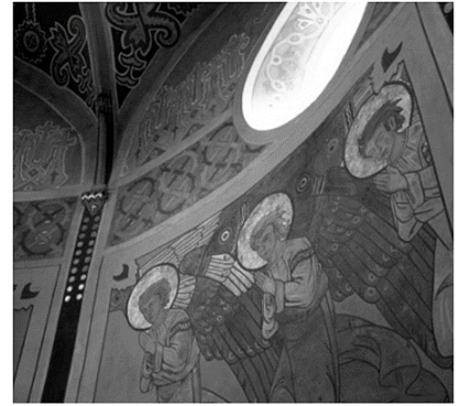
Fig. 6. Polychrome paintings by M. Sosenko (1911–1913), photo by A. Tyrpych, 2013

Church of Resurrection of Christ, located in Polyany village (Rykiv village till 1946), Zolochiv district, Lviv region, was designed by the architect V. Nahirnyi and dates back to 1903. In 1913–1914, Modest Sosenko created icons for the iconostasis and the two side altars and painted the central dome of the nave (Fig. 7–9).