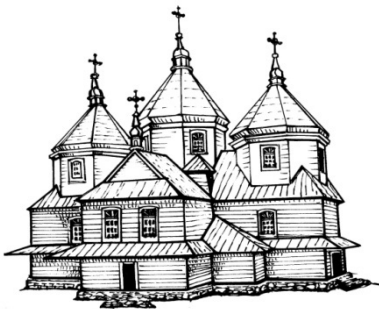
Fig. 7. Church of Resurrection of Christ, Polyany, graphics by A. Tyrpych, 2015

Church of Resurrection of Christ, located in Polyany village (Rykiv village till 1946), Zolochiv district, Lviv region, was designed by the architect V. Nahirnyi and dates back to 1903. In 1913–1914, Modest Sosenko created icons for the iconostasis and the two side altars and painted the central dome of the nave (Fig. 7–9).