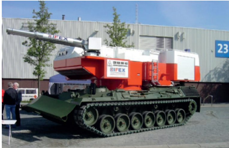
Fig. 7. Fire Commander [13]

to the base of a fire in 4 seconds. This provides an immediate, simultaneous and powerful dousing force in terms of volume across the entire affected area. The main difference for this installation is the powerful dousing impact in conjunction with the effect produced by a special powder formulation. The effective discharge range is up to 50 m.