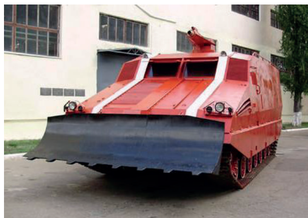
Fig. 2. Some examples of appliances with fixed monitors [13]