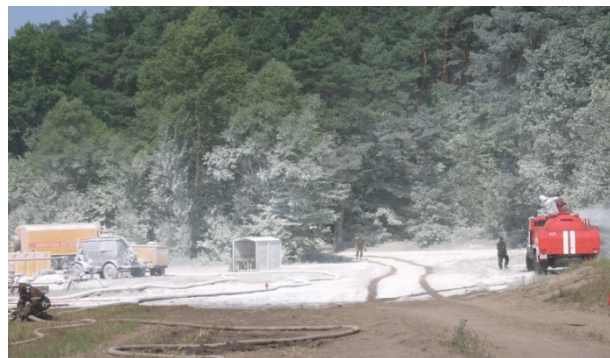
Fig. 4. Extinguishing of gas blowout fire by using a powder jet

There are known developments of an approach [24-25] based on a bombardment of the combustion zone with inert gases, within certain parameters relating to gas volume and speed of delivery. However, in practice, this approach is very seldom used.