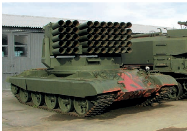
Fig. 6. Setting the extinguishing pulse "Impulse-Storm"