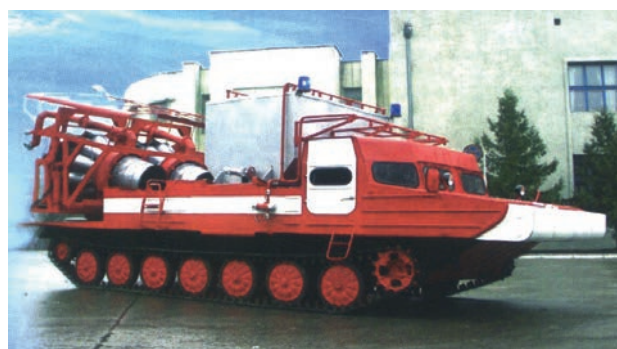
Fig. 3. Gas/water jet extinguishing vehicles [17], [18], [21]