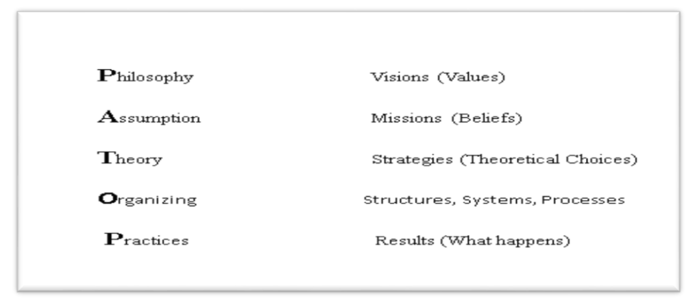
Figure 1. The PATOP model of the organization