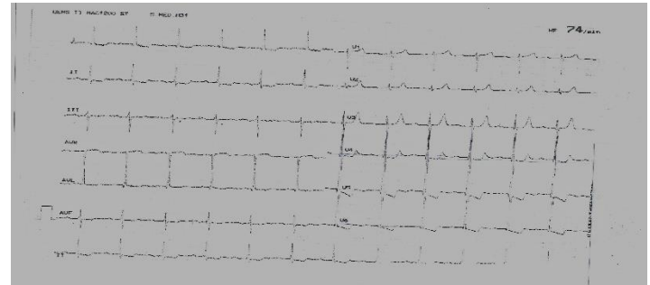
Fig. 1. ECG

ECG revealed sinus rhythm, HR was 74 bpm. left axis, left ventricular hypertrophy, AV-Block I, T- neg.: I, II, V5-6 (Repolarization problem) (fig.1).