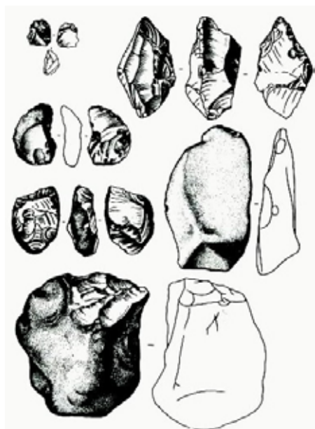
Azykh cave, Guruchay stone (labor) tools

As a result of complex scientific research conducted in the territory of Azerbaijan, it was found that 2.5 million years ago, primitive people settled in the Azykh and Taglar camps, which are natural karst caves. During the camp excavations of the Azykh Paleolithic, more than 300 stone products, bones of hunted animals, rough hand tools, cubic tools, rough blades, well-preserved fragments of the impact surface, etc. were found (Figure 1). Furthermore, based on the remains of material culture found in the Taglar camp, it is possible to study the techniques, typology, and features of the formation of tools of the camp residents (Jafarov, 2018).