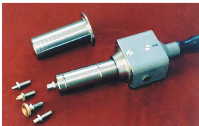
Fig. 2. Thermoelectric cryoextractor.