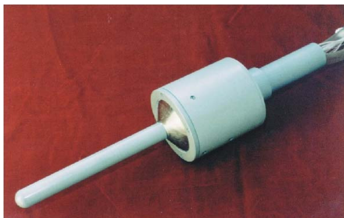
Fig. 3. Thermoelectric hypotherm for oncology.