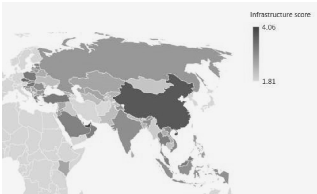
Fig. 2. Quality of trade- and transport-related infrastructure of BRI economies; Source: International LPI 201812

It should also be noted that apart from the LPI factor, which indicates the experience of counterparties with the country's logistics infrastructure, it is important to understand the status of key infrastructure entities that will be involved as logistics hubs and key facilities in the BRI project. Table 1 show the results of the survey on the quality of ports, roads, railways and airports of the BRI members [7]: 100 – very low quality, 0 – good quality. In the table indicated part of the countries, which will participate in the BRI project.