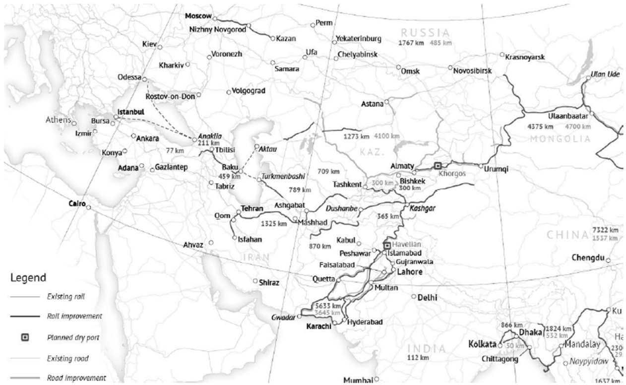
Fig. 4. Map of Transport Improvements under the BRI.

important element of diversification of supply routes, cheaper and also keeping the pricing policy at a very flexible level when there is variability in cargo delivery options. In the figure 4 depicted areas where was made transport improvements under the BRI project.