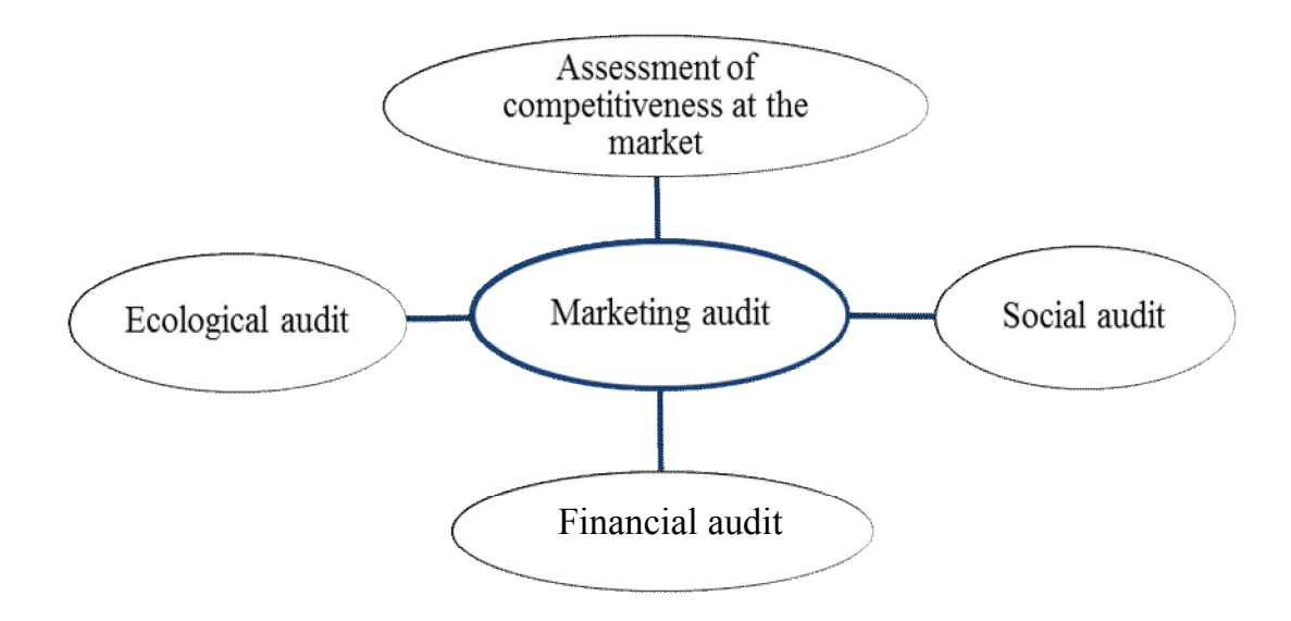
Fig. 1. Interaction of the marketing audit with other types audit