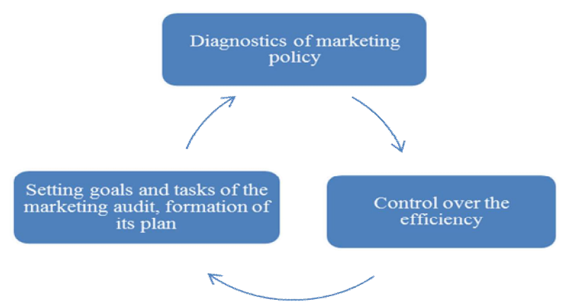
Fig. 2. The process of marketing audit