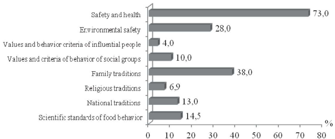
Figure 2. Segmentation of the respondent's group members of Generation Y in Ukraine based on the moral and ethical values and criteria while purchasing foodstuffs*

only for 4,0% of consumers. The vast majority of respondents are governed by their own beliefs. The basic value underlying belief and behavior systems in the food market of the respondent's group members of Generation Y in Ukraine is a consideration of health safety of foodstuffs. Ultimately, 73,0% of respondents carry out purchases by this criterion, thus indicating their tendency to rational decisions.