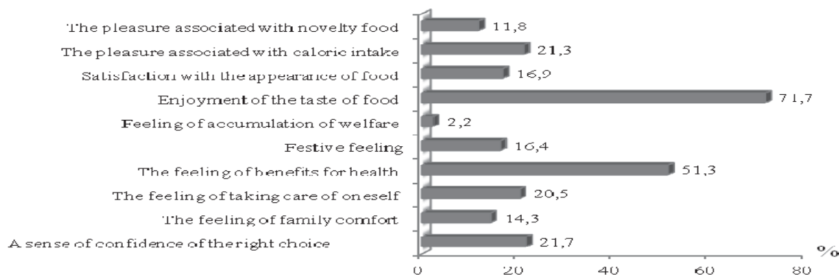
Figure 3. The distribution of the respondent's group members of Generation Y in Ukraine based on their positive emotions and associations of food*