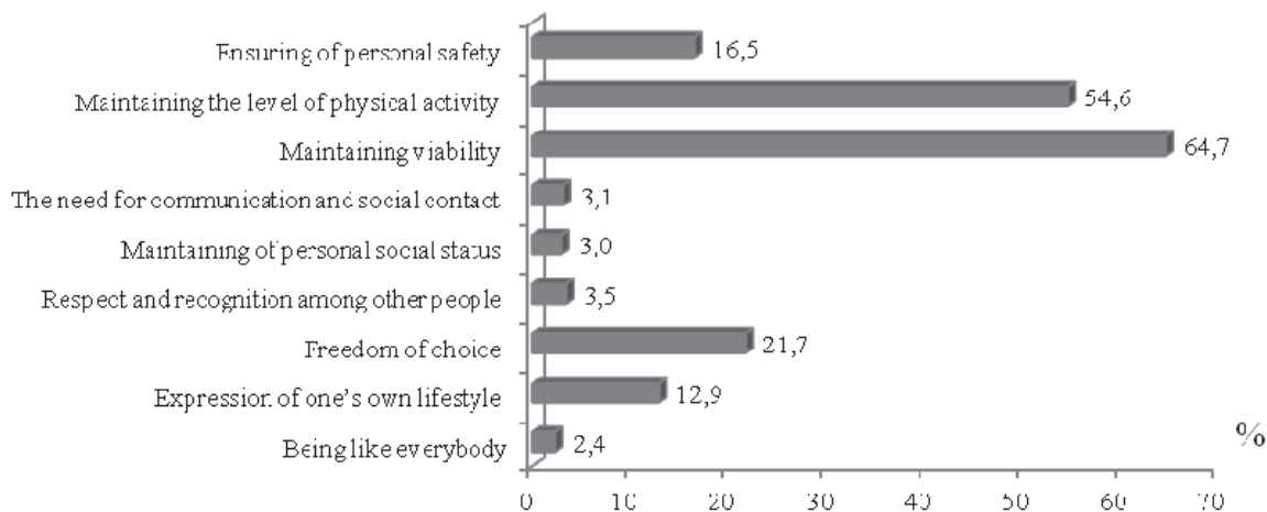
Figure 1. Segmentation of the respondent's group members of Generation Y in Ukraine according to their perception of foodstuffs as necessity*

terms of foodstuffs. This study attempted to identify the views of the youngest generation of Y segment in Ukraine on their perception of foodstuffs as their needs (Figure 1).