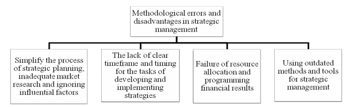
Fig. 1. Methodological mistakes and disadvantages in strategic management

The above barriers and problems are not the only ones facing towards quality strategic planning in Ukraine. Many companies do not able to implement it. The reason – the assumption is methodological errors (Fig. 1).