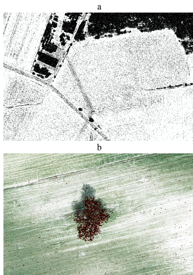
Fig. 1. The result of cross-correlation calculation for two digital orthophotos. Points denote pixels with negative correlation. Local compaction of points indicate presence of high-level objects

The results of the cross-correlation calculation are shown in Fig. 1. There are indicated only those points in which the correlation coefficient received negative values and according to our experiment conditions that indicates incorrect height mark settings in a specific point of terrain model.