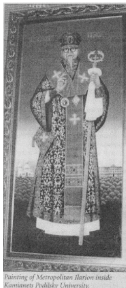
Painting of Metropolitan Ilarion inside Kamianets Podilsky University.