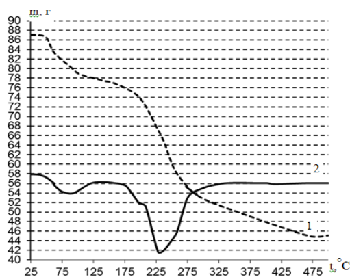
Fig. 3. Thermogram of DSC for the thin films based on system «NEA pectin:NaAlg:Ca 2+ » at the ratio of input substances 1.5:1.5:0.5 (1 – temperature (T, °C); 2 – DTG)

Research of the envelopes samples behavior for higher heating and the process of internally bonded moisture loss were the next stage of the derivatogram description (Fig. 3).