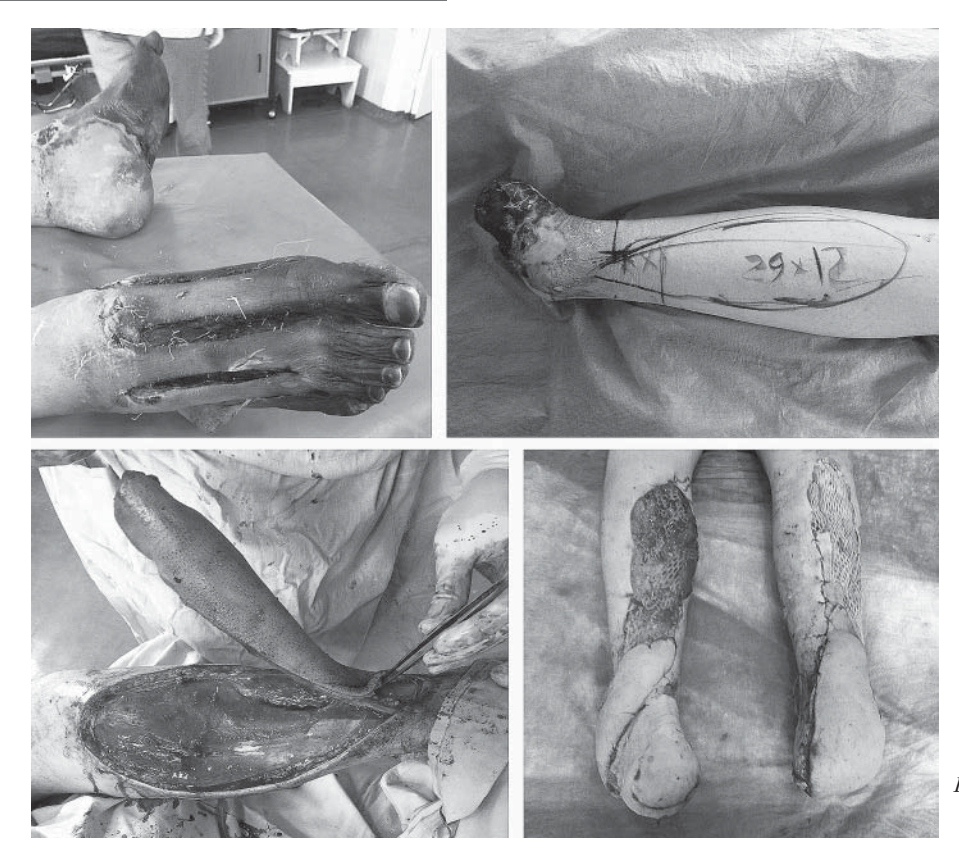
Fig. 3. Both feet stump plastic surgery after 4<sup>th</sup> degree frostbite with tissue megacomplexes at sural artery using "Propeller" –technique.

During this procedure septocutaneous branch of fibular artery and two concomitant veins that exit from posterior intermuscular septum of the shin within 6 cm area and proximally to the lateral malleolus tip ( Fig. 2 ) were thoroughly separated.