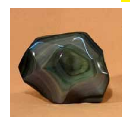
Figure 2. Banded obsidian.

We can significantly extend the list of onyxes on the basis of structural, mineralogical and genetic indicators described above. In addition to the above-given agate (chalcedony), calcite and aragonite onyxes, we can also identify other types - onyx-perelivt, malachite, rhodochrosite, opal and fluorite onyxes.