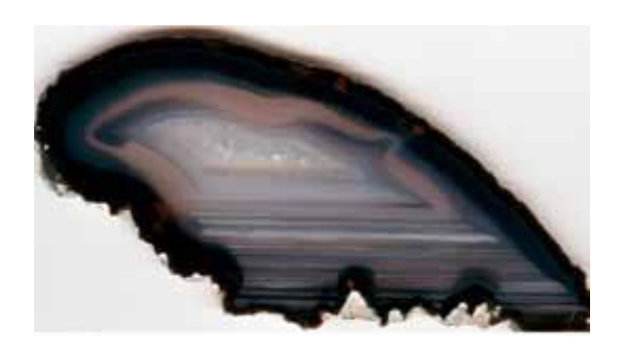
Figure 1. Agate amygdale combining concentrically zonal and straight-banded onyxes.

Following the traditions, onyx means banded (rhythmic-zonal) chalcedony agate. It can be concentrically or straightbanded and coloured differently. Some authors (Kornilov, Solodova, 1986; Golovikov et al., 1987) think that agates and onyxes shall be differentiated. In agates strips of different colour form concentrically-zonal pattern and onyxes are banded agates (agates of the Uruguayan type) with straight-banded pattern. We think that such limitations on the basis of the pattern type are excessive because the type of banding is frequently defined by the direction of cutting (section) and the size of the item cut. Moreover, amygdales of some aggregates frequently contain zonal-concentric chalcedony from outside and straight-banded (parallelbanded) chalcedony inside, therefore, we need to call different parts of a single formation differently (Figure 1).