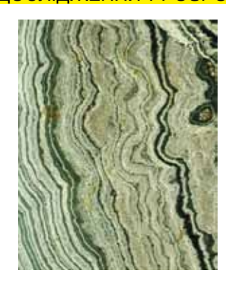
Figure 3. Metasomatic rhythmicity of wollastonite-hedenbergite skarn. From the collection of D.I. Savrasov's Kimberlitic Museum of the Diamond Company ALROS

The largest malachite deposits are located in Africa. There they are