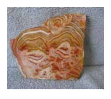
Figure 4. Onyx-perelivt, Shaitanskoye deposit (the Urals).

Shaitan perelivt – a beautiful ornamental stone – unquestionably has all onyx qualities (Kornilov, Solodova, 1986) (Figure 4). It was found in the form of vein bodies at the eastern slope of the Northern Urals near the Shaitanka village. Perelivt is a small-crystalline dickite-quartz aggregate of hydrothermal origin with banded structure. Exteriorly onyx-perelivt is very similar to onyx-agate, but the latter is a chalcedony variety – a cryptocrystalline finely-fibred quartz variety. Perelivt can be considered onyx both in terms of structural and genetic features.