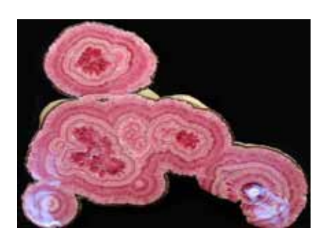
Figure 6. Cut of dripstone rhodochrosite onvx. From the collection of the Museum of Natural History, Vienna (Austria)

At the Torgashino deposit a single gigantic concretion was found with the diameter exceeding 1 m. There was a fragment of light-grey calcitic limestone inside it up to 20 cm across. It was grown over by an aggregate of compact