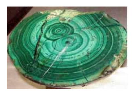
Figure 5. Concentrically zonal malachite onyx. From the collection of the Fersman's

From the collection of the Fersman's Mineralogica