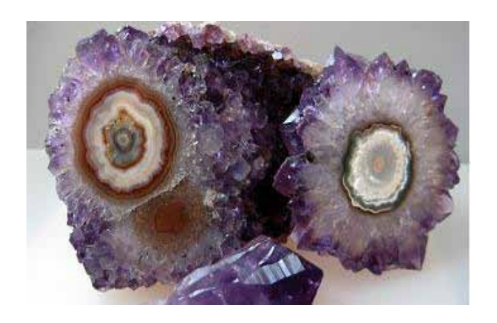
From the collection of the Mineralogical Museum of the Siberian website www.catalogmineralov.ru. Federal University