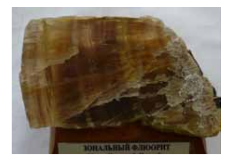
Figure 8. Fluorite onyx of the Kalanguyskoye deposit. From the collection of the Mineralogical Museum of the Siberian Federal University