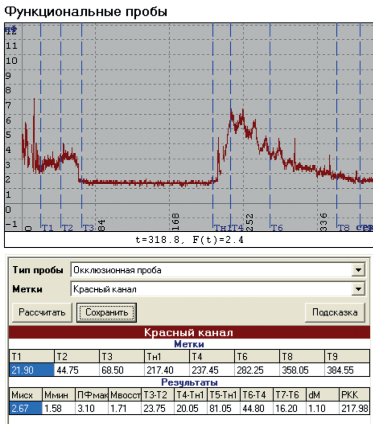
Fig. 1. Occlusal test. Normocirculatory hemodynamic type of microcirculation

the microcirculatory bed due to spasm of precapillary sphincters. initial IM reduced < 4.5 p. u., and at OT the type of blood flow for arterial occlusion is reactive (decrease in IM during occlusion by less than 1.5 p. u.); CBFR > 300 %. Stasic HTM is noted at decrease in speed and stasis of blood flow at the level of the capillary unit, as well as at the level of the post-capillary unit- venules and postcapillaries. Thus IM < 4.5-6.5 p. u., the degree of decrease in IM depends on the severity of the phenomena of blood stasis and rheological disorders (aggregation of blood elements, sweet phenomenon); CBFR < 200 %. Type of blood flow to arterial occlusion – areactive. This type of microcirculation is noted in paresis of vessels of inflow and disturbance of outflow [4].