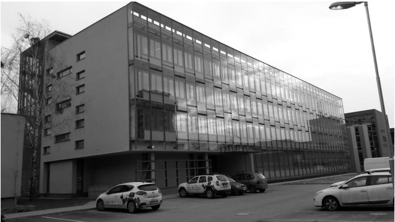
Figure 1: Front view (WEST) of TECHNIKOM (Science & Technology Park) building