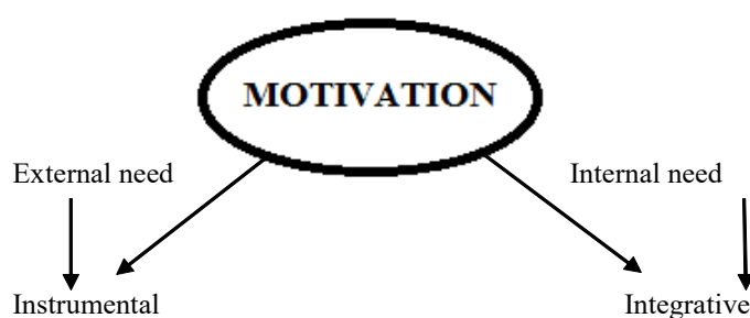
Fig. 1. Motivation for language learners

considered to be a key priority for education system. Thus, how can we define the term “motivation”? According to Masgoret M. and Gardner R. (2003), “motivation refers to goal-directed behavior, and when one is attempting to measure motivation, attention can be directed towards a number of features of the individual. The motivated individual expends effort, is persistent and attentive to the task at hand, has goals, desires, and aspirations, enjoys the activity, experiences reinforcement from success and disappointment from failure, makes attributions concerning success and/or failure, is aroused, and makes use of strategies to aid in achieving goals. That is, the motivated individual exhibits many behaviors, feelings, cognitions, etc., that the individual who is unmotivated does not” [4, 173].