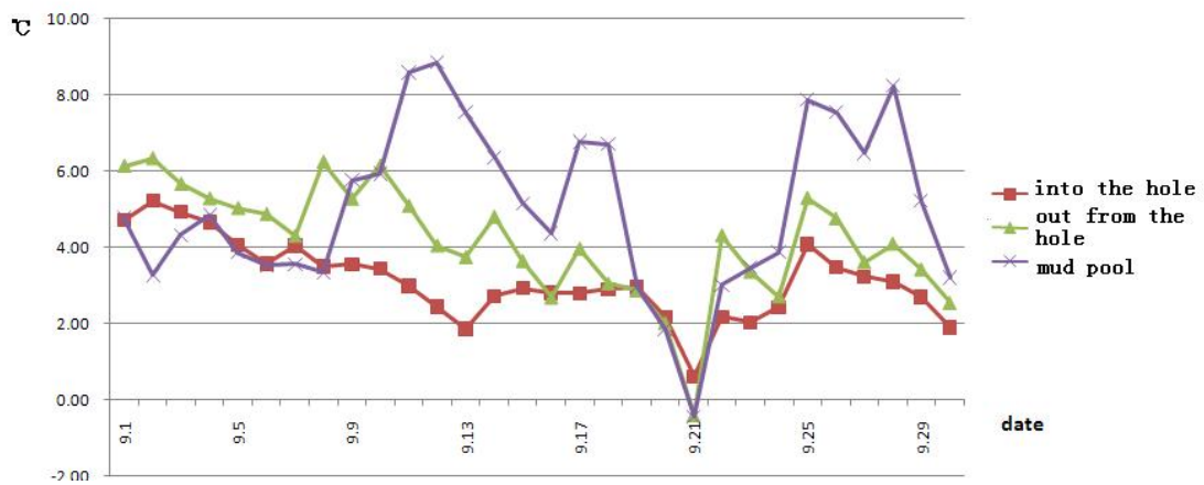
Fig.2. The temperature & time curve of mud

During exploration construction of gas hydrate drilling MK-1 borehole, the mud cooling system had got satisfactory test results. Time curves(as figure 2) of mud temperature had been drawn based on field measured data ranging from 111.30 to 458.10 m.