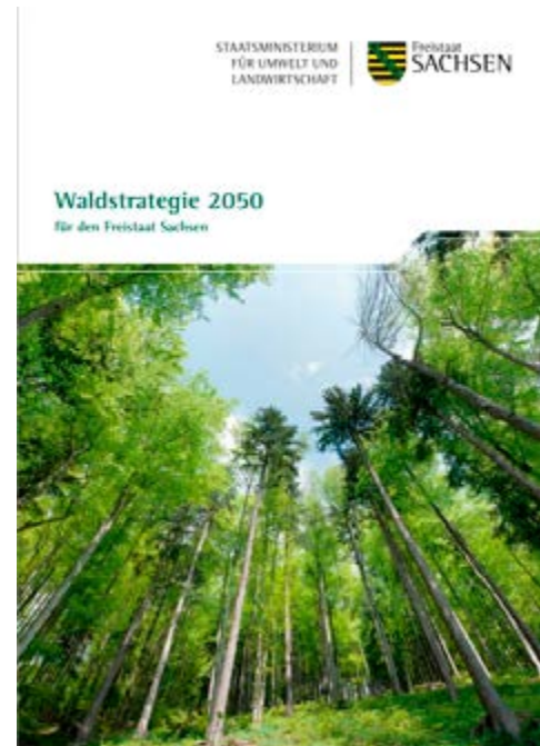
Fig.4: Forest Strategy for Saxony 2050 (Waldstrategie 2050 für den Freistaat Sachsen).