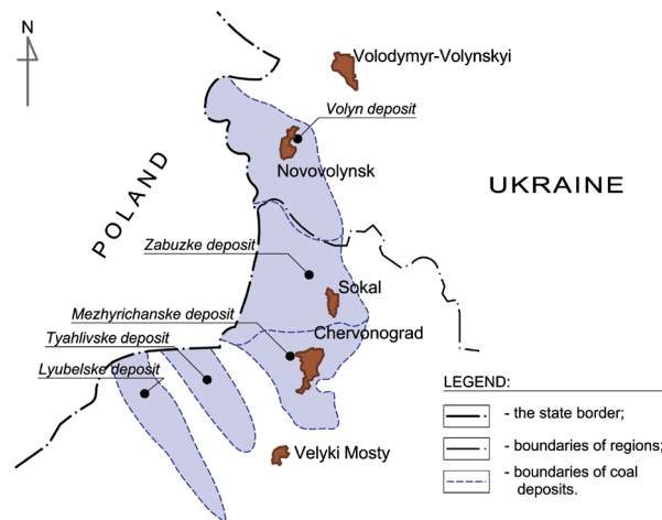
Fig. 1. Scheme of placement of coal deposits of Lviv-Volyn coal basin

In 1954 near Chervonohrad, a new mining settlement Hriada was founded, which gained the status of a settlement of a town type in 1956 and was renamed into Hirnyk. In the spring