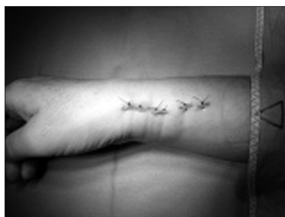
Fig. 5. Skin closure after the procedure

ideal position for the first wire is the subchondral bone area. The K-wires should not penetrate the opposite corticalis. In case of need a Repositioning of the radial length is now possible by pulling the device.