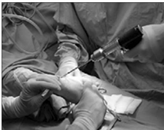
Fig. 2. Closed reduction of the fracture by insertion of a Kirschner wire