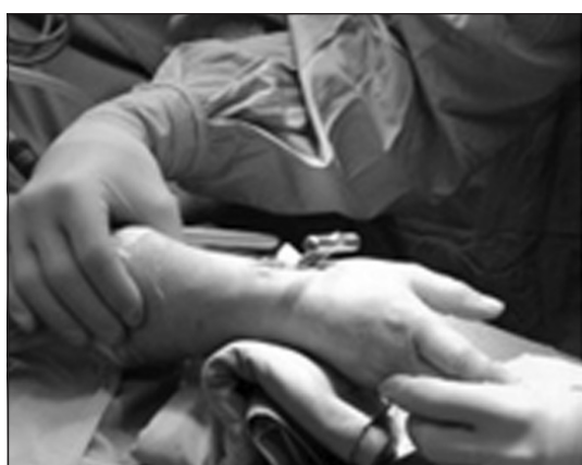
Fig. 3. Stepwise widening of the intramedullary canal