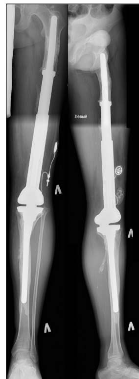
Fig. 4. MUTARS growing prosthesis in distal femur replacement. Note the small implant connected to an internal motor that is implanted subcutaneously and can be controlled by an external device

can preserve the growth plate in the uninvolved side of the joint. The new MUTARS Expand uses a similar approach. A motor housed in the prosthesis is connected to a subcutaneous receiver and can be activated and controlled by an external device, allowing exact length adjustment (up to 10 cm) without any surgery (fig. 4). Both systems can be controlled in the outpatient clinic without hospitalization. All these prostheses are designed to bear the corresponding loads over several years but they are only adjustable in length and do not grow concomitantly in strength and breadth. The devices might be at greater risk of breaking under the adult weight and finally would have to be replaced by a permanent implant. After unsatisfying results at the beginning of the era of growing prostheses, the first experiences with the new systems are promising. But whether they will prove of value in practice can only be answered over time.