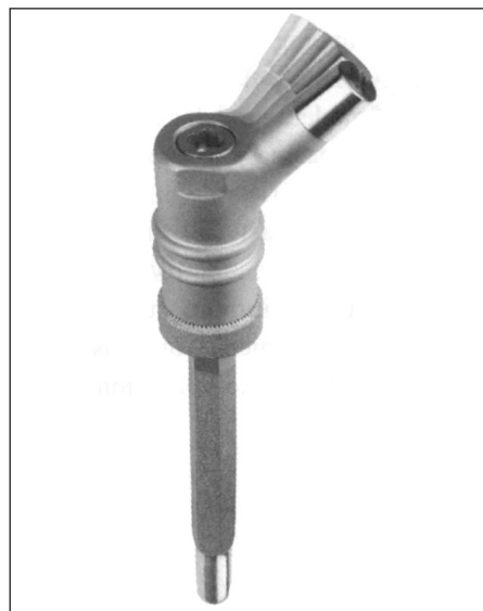
Fig. 1. MUTARS proximal femur with hydroxyapatite-coated titanium stem. The hexagonal shape provides excellent primary rotation stability. The modular design allows torsion adjustments in 5° increments

Surgical Technique: With the use of the Modular Universal Tumor and Revision System (MUTARS-Implantcast, Buxtehude), major osseous defects of the upper and lower extremities can be successfully reconstructed [10]. The modular design allows individual reconstruction of defects in 2-cm steps and torsion adjustments in 5° increments (fig. 1). The different modular components are fixed with screws. Frequently, tumor prostheses are used for reconstruction of the proximal and distal femur, the proximal tibia, and proximal humerus. Even replacements of total bones, such as the total femur or humerus including the adjacent joints, are becoming increasingly common [49]. Nowadays stem-anchorage of most tumor prostheses can be accomplished without bone cement. We use hydroxyapatite-coated titanium stems with a hexagonal shape that provide excellent primary rotation stability (fig. 1). The usual stems have a length of 12 cm whereas the diameter is planned individually on digital X-rays (usually not measuring below the 12-mm core diameter). Cemented anchorage in tumor prostheses is mostly indicated in older patients (over 60 years of age), those with advanced osteopenia, prolonged