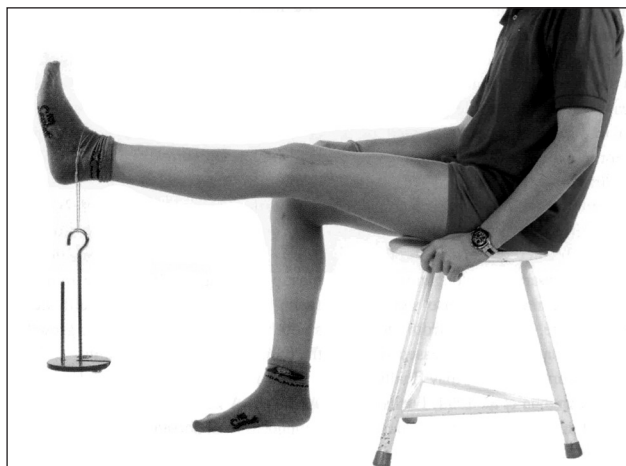
Fig. 3. Functional outcome after proximal tibia replacement and refixation of the patellar ligament to the attachment tube

Constant improvements of prostheses material and surgical techniques lead to a steadily increasing number of patients with limb-sparing procedures using modular tumor prostheses. The typical indication for modular endoprostheses is a large osseous defect after resection of a malignant bone tumor of the meta-diaphyseal region of a long bone in the upper or lower