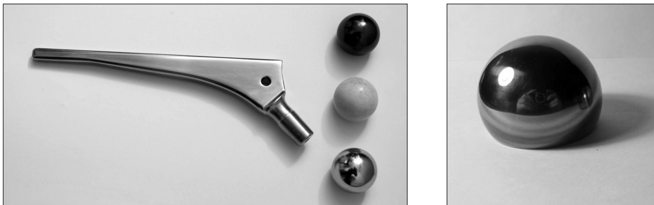
Fig. 1. Unipolar femoral head surfaces made of stainless steel coated by oxide and oxynitride nanocomposite films

substrates were cleaned in ultrasonic bath with standard technology. The nano structural \text{Al}_2\text{O}_3 (MS) and \text{AlN}/\text{Al}_2\text{O}_3 (MS) films were deposited by magnetron sputtering method in high vacuum pumping system. The main details of the magnetron and ion source in the sputtering chamber were demonstrated at [21–25].