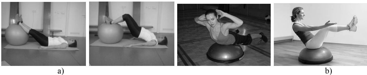
Fig. 1. Exercises on fit-ball (a) and on BOSY (b)

Exercises on unstable surface are more effective than power trainings, because in such exercises patient has to keep balance, involving small muscles-stabilizers. Stimulator BOSU ensures multi-functional training, preparing patient for everyday life. The trainings improve vestibular apparatus, develop strength and dexterity, flexibility and coordination, as well as posture. We used such exercises as [11]: hyper-extension, exercises for abdomen muscles, for core muscles. Basic exercises for core muscles: bridge, bar on one leg (the other moved aside); side bar with additional weight. Examples of some of these exercises with the help of fit-ball and BOSU stimulator are presented in Fig.1.