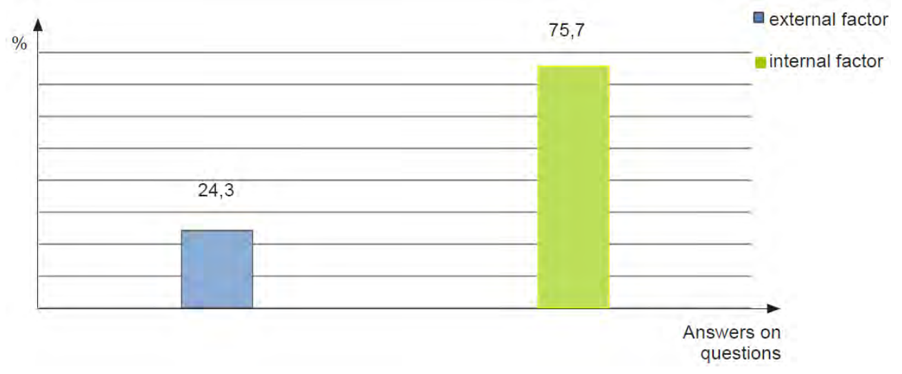
Fig. 1. Answers on questions "What factors have the biggest influence on making a decision by offender to attack a militia worker?"

The analysis of results of questionnaire showed that behavior of offender depends on external terms (luminosity, weather terms) and part of day. It is set that almost at 60% situations they operate in the conditions of darkness. Darkness influences not only on psychological firmness but also on a motive process on the whole. Scientists [1, 5] notice that during a collision with a criminal in such terms law enforcements operate uncertainly and, even, confusedly. The weak directivity in unusual terms is accompanied by a speed of reaction, exactness of motions loss [1, 6-10]. The terms of darkness cause psychological and muscular tension that in turn influences on firmness of implementation of passing ahead or protective actions. Timeliness of the motive reacting in the conditions of darkness almost on two orders below, than on the lighted up locality [1, 4]. In 68% cases, workers collide with criminals in the conditions of darkness, they succeeded to disappear. On this occasion V.I. Plisko (2008) marks that part of day is a basic factor, that influences on the dynamics of development of situations that pop up.