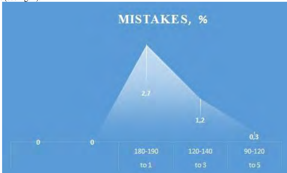
Fig. 2. Dynamic of mistakes depending on alternation of loads and rest of qualified handball players

From this fact we noted that general tea, HBR usually fluctuates between the lowest and the highest, independent on status of the match and its intensity. We determined that before coming of players on site HBR is 160-180 b.p.m. As a result of replacements, if handball player had rest about 5 minutes, HBR was 90-120 b.p.m. Percentage of mistakes' correlation was within – 0,3%. With rest up to 3 min. HBR reached 120-140 b.p.m.; mistakes – up to 1.2%. If duration of rest before micro series of loads reached 1 minute, quantity of mistakes reached 2.7% with pulse 180-190 b.p.m. (see fig. 2).