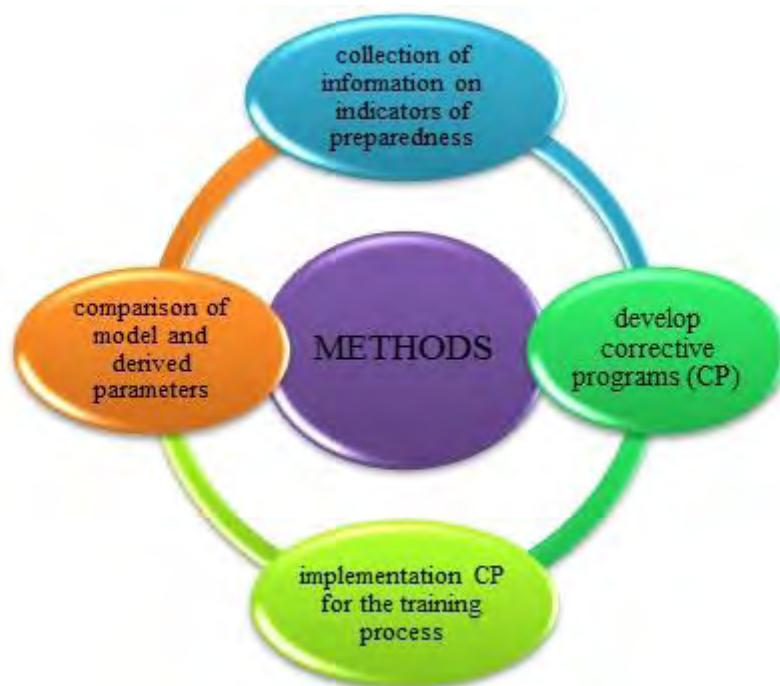
Fig.1. Methods of effective realization of training's programs and purpose.

With such approach to control role of choice and registration of system of factors, which influence substantially on competition results, increases significantly [8,10]. It results in need in studying of competition functioning, integral reflections of fitness's levels as one of important tasks of control in system of informational provision of managements [3,11]. As main directions of methodic a number of scientists [6,7,9] offer methods, depicted in fig. 1.