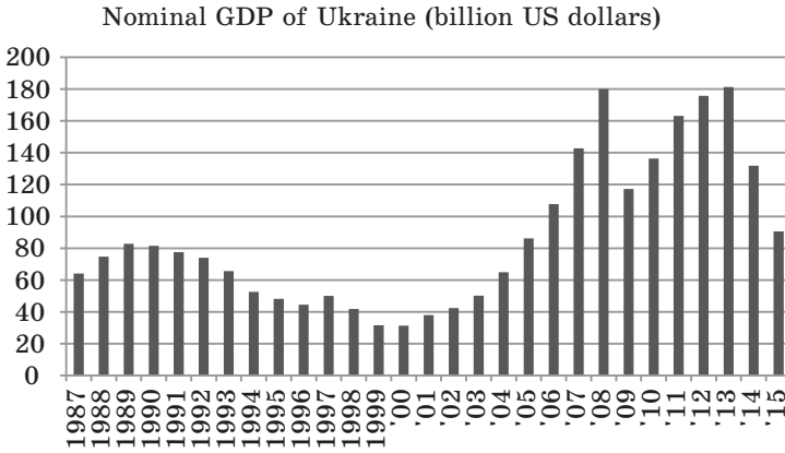
Picture 1. Nominal GDP of Ukraine in 1987-2015 [7]

Dragon Capital, an investment bank based in Ukraine, carried out a research that shows the main obstacles for foreign investments in Ukraine [8]. The survey shows that the major obstacles are: widespread corruption (8,5 points), lack of trust in judiciary (7,5 points), military conflict with Russia (6,1), unpredictable currency and unstable financial system (6), restrictive capital and F/X controls (5,5), complicated tax administration (5), and cumbersome legislation (5). At the same time, foreign investors suggest to hire new judges, prosecute high-rank officials for corruption, follow the IMF program, liberalize foreign exchange controls, complete several transparent privatizations, streamline tax administration, and overhaul domestic infrastructure. In our opinion, most of the suggested actions will help to boost innovativeness too, since business environment and innovativeness are tightly interconnected.