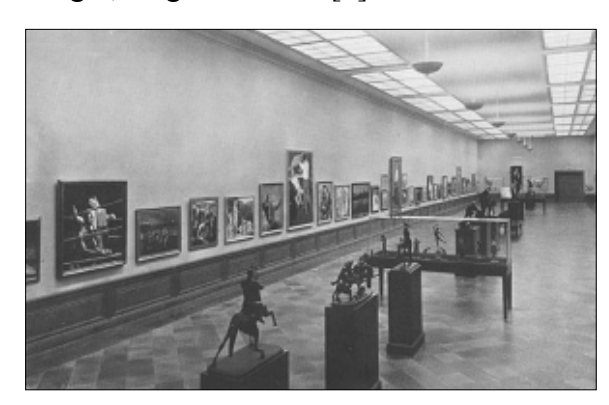
Pic. 1. One of the Exhibition Galleries, Los Angeles, 1932

In addition to the general rules, there were certain requirements for certain types of work. In particular, literary work which was applied to the arts competition, should not be more than 20,000 words. Language for writing of the work was not limited, on condition of its translation in French or English (in some cases abstract in specified languages was considered enough). One author was allowed to present several of his works. For participants it gave an opportunity to compete for more medals in one category [2].