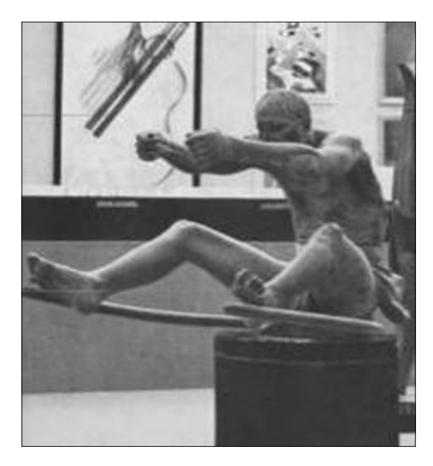
Pic. 2. Artwork "The Sulky Driver". Author – Farpi Vignoli (Italy). 1st place in the category "Sculpture" (round sculture). Berlin, 1936

Artists reflected in their artworks a wide range of competitive sports: boxing, wrestling, horse racing, athletics, ski jumping, skating, etc. (Pic. 2, Pic. 3). Dreams of Pierre de Coubertin to implement the Greek ideals of unity of body, mind and spirit, which he defined as "sport plus art" to some extent came true [2].