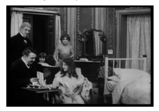
In the final scene of Falling Leaves, Trixie appears in the door to intervene in the resolution of the drama by getting her parents out of the room