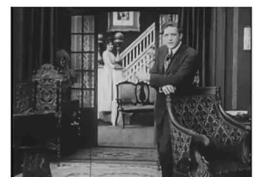
In A House Divided and The Girl in the Arm-Chair, plot development is made primarily by means of composition

and science as well. To consider that the cinematographic image finds its origins in the photographic image, the latter had as a project, first of all, to promote realistic representation of an accomplished fact or a verifiable element. With help of optics and chemistry, photographies then become fixtures of geometric images by emulsion. The camera, restoring the photographed object, produces the perspectivist's projections and records the light footprint on receptible surfaces. This is an instrument that universalized the project of Renaissance theorists and painters, as it promotes the type of image that rational thinking required of these artists: figurative images governed by the laws of geometry, which are perceived in their two-dimensional plane as though they were in three dimensions. Erwin Panofsky has shown in his essay «The perspective as a symbolic form» that the study of perspective was the promotion of art to science; thus, the subjective point of view on the world accesses the level of objectivity: by the invention of perspective, we managed to make a «translation of psychophysiological space into mathematical space; in other words, an objectification of the subjective» [15, p. 66].