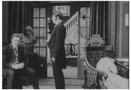
In The Girl in the Arm-Chair, Peggy is a looking character in the sense that she is not viewed by others

concurrency that Alice Guy would have had with Georges Méliès, as was mentioned earlier. In a DVD collection with an eloquent title, Gaumont Treasures, 1897-1913, Alice Guy's filmography begins with The Fisherman at the stream (1897), a unique frame film, and it is followed by other films with features and themes recurrent throughout the early cinema, such as theatrical or painted decorations, dances, special effects and amazement effects, substitution techniques, characters and frames roaming through different films, and the mise en abyme of new image production techniques like the gentleman destabilized by the camera in At the photographer's (1900). Yet it was not until 1900 and later that the films from this collection slowly began moving away from Lumiere's conception of cinema as a way to capture the real. For example, in The Landlady (1900) the action is based on the hierarchical arrangement of the figures in the frame (the culminating points are moved to the center, while others are clearly at the margins).