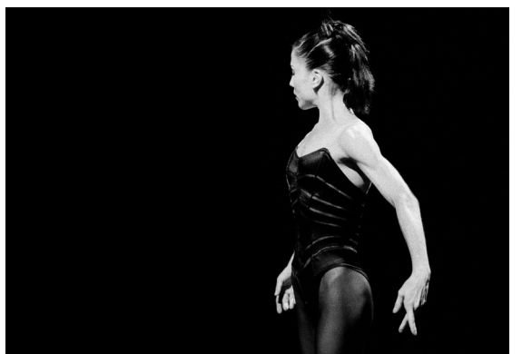
Human Steps, performed in May 2008 in Vienna, Austria