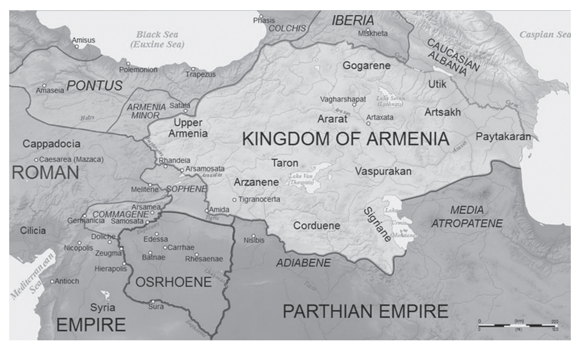
The Parthians – a Worthy Enemy of Rome? Remarks on Roman-Parthian Political Conflict...