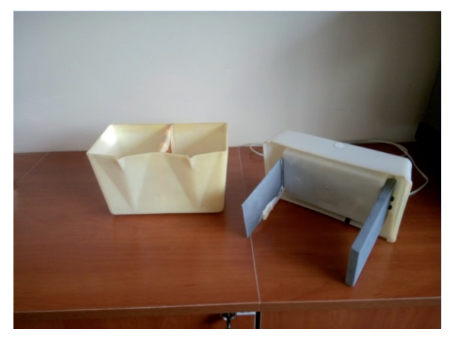
Fig. 1. External appearance of electric water activator 3AB-3

Using electric water activator \Im AB-3 , 2.75 dm<sup>3</sup> of source water was activated for 1 hour 10 minutes. 1,0 dm<sup>3</sup> of catholyte was used for the experiments.