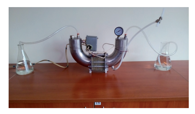
Fig. 2. External appearance of electric hydrogen generator H2-13B2

Hydrogen obtained by electrolysis of 30 % aqueous KOH solution was used in experiments using pure hydrogen generator H2-13B2 («Vodorod», Ukraine) (Fig. 2).