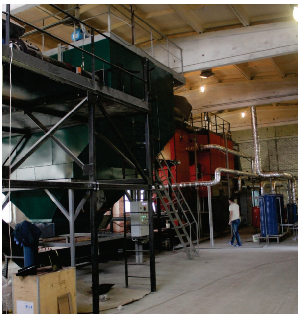
Fig. 1. An incinerator plant for burning of radioactive contaminated wood for the removal of contaminated combustion products from flue gases

Studies were conducted in Chernobyl, Ukraine on an incinerator plant equipped with a gas stream cleaning system and includes coarse and fine cleaning (Fig. 1). Application of two-stage cleaning allows to increase the efficiency of dust and gas cleaning equipment and to reduce emissions of radiation ash. A schematic diagram of the plant is shown in Fig. 2.