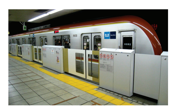
Fig. 2. Yellow warning strips

All this usually leads to the thought of the need to apply new methods and technologies on the platforms of the subway and the railway.