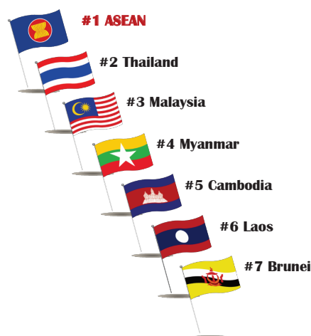
Fig. 1. Free Trade Agreement preference for EU business [13]

And according to EU business – FTA launch between EU and ASEAN is preferable than just between some countries inside of unions. Fig. 1 shows a list of Free Trade Agreement preference for EU business based on performed reforms and level of development of local economics.