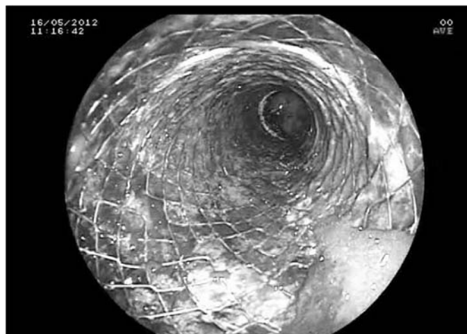
Fig. 1. Dilated sigmoid lumen in the tumour zone following stent placement CHOOSTENT M.I.Tech, South Korea (CY)

All radical operations were completed with the formation of the primary anastomosis without colostomy exteriorization. The postoperative period was uneventful. The duration of treatment in this group was 19,7 \pm 2,1 days of bed regimen.