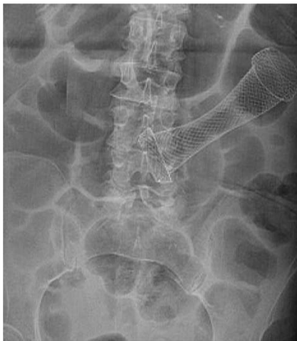
Fig. 2. Plan survey radiograph of the abdominal cavity immediately after self-expanding intestinal stent placement into the sigmoid colon