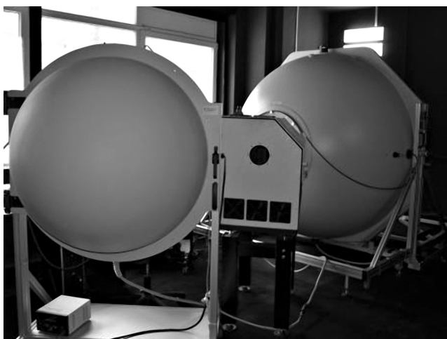
Fig. 2. Appearance of the photometric and LEDs units

The structure of photometric unit includes an external radiation source, which is the result of joint work of BelGIM, Institute of Physics, National Academy of Sciences of Belarus and Belarusian company “Tseris Analytic”.