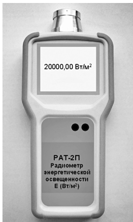
Fig. 3. PAT-2П

Measuring blocks of mentioned devices are made in the same type of portable frames with indication based on liquid crystal displays, combined power (from the net and battery) having low power consumption.