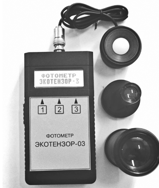
Fig.1. Photometer Ecotenzor-03

vironment in general. To ensure such control measuring equipment the RPC “Tensor” for 26 years develops and manufactures measuring devices to measure physical environmental factors, including radiometric and photometric characteristics of optical radiation in the ultraviolet, visible and infrared regions of the spectrum, measuring microclimate parameters and metrological equipment.